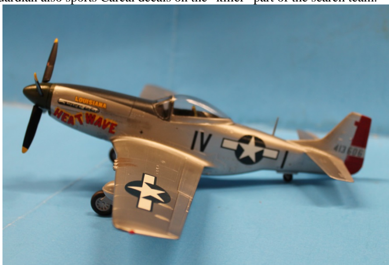
Rod Currier's draw in the "pass the stash" was this Fujimi 1/48 th P-51D Mustang, built "out of the box" using Alclad paints.